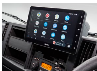
MyISUZU CO-PILOT audio visual unit