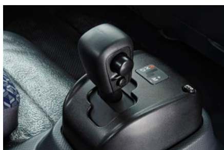
AMT model shown