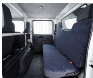
Crew cabin rear