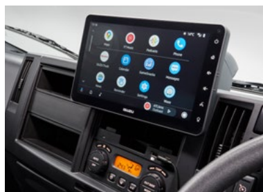
MyISUZU CO-PILOT audio visual unit