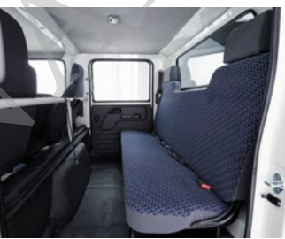
Crew cabin rear