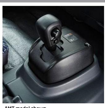
AMT model shown