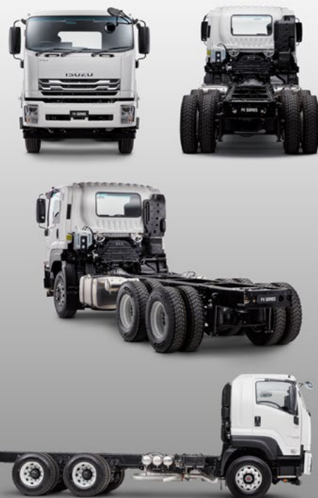
FXV MODEL PICTURED