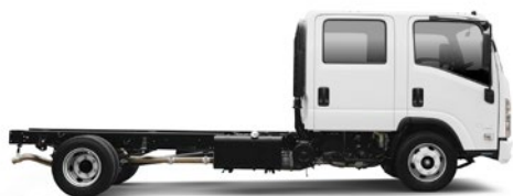
NPR 75-190 Crew