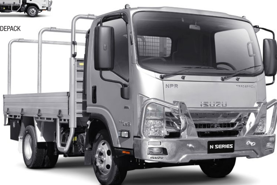
SWB PREMIUM TRADEPACK

Heavy duty aluminium tray / Heavy duty galvanised ladder racks Integrated load restraint anchor points / Headboard including rear window protector / Removable drop sides and rear tailgate Isuzu satellite navigation and reversing camera / Genuine Isuzu Bullbar and 3,500 kg rated towbar