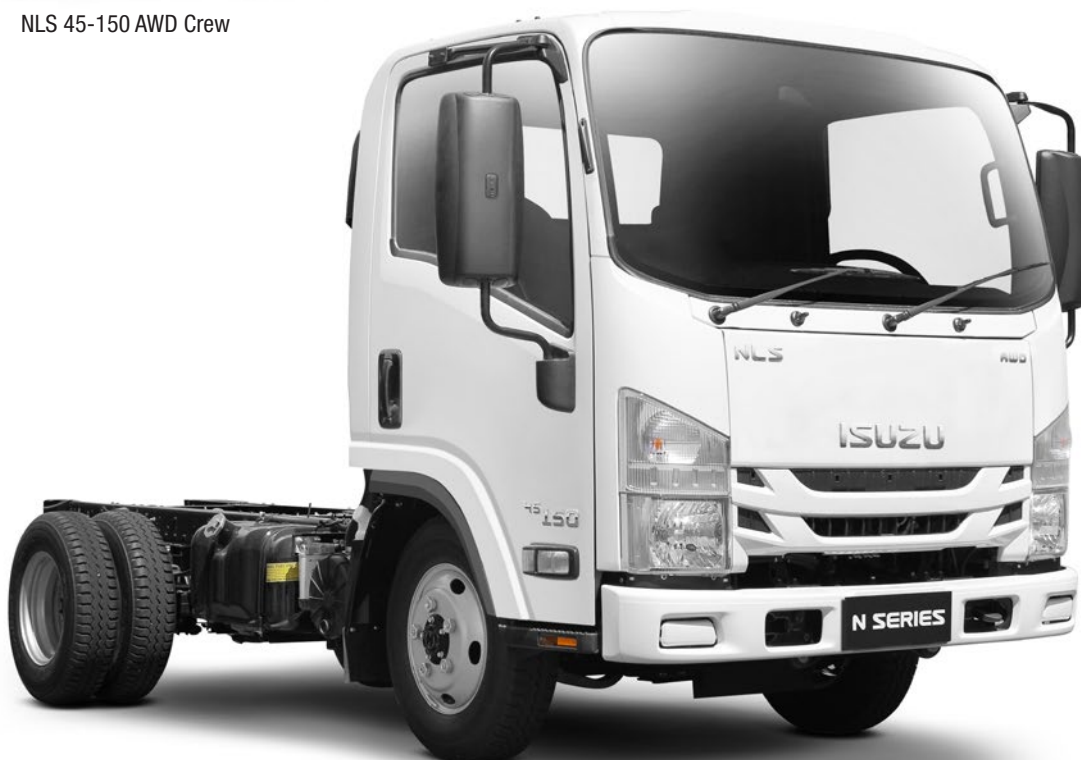
NLS 45-150 AWD

AUSTRALIA'S TOP SELLING TRUCK BRAND SINCE 1989.