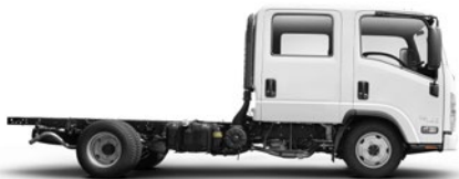
NLS 45-150 AWD Crew